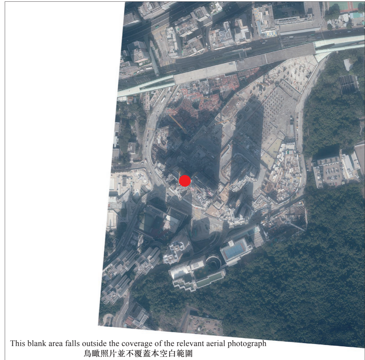
This blank area falls outside the coverage of the relevant aerial photograph 鳥瞰照片並不覆蓋本空白範圍